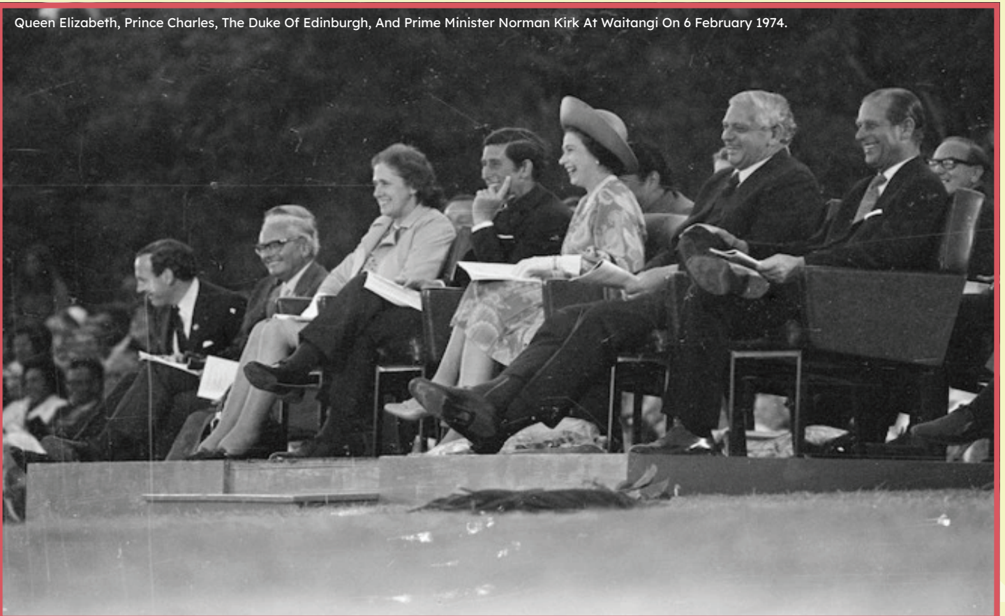
Queen Elizabeth, Prince Charles, The Duke Of Edinburgh, And Prime Minister Norman Kirk At Waitangi On 6 February 1974.

Ki te pīrangitia ētahi atu kōrero mō Te Tiriti o Waitangi, tēnā, matakina te kiriata ‘The Big Problem with the Treaty of Waitangi’ .