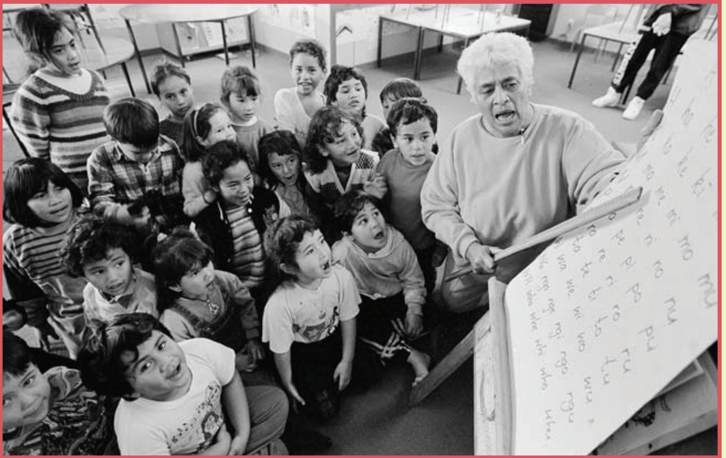
Ref: EP/1991/2155/3-F